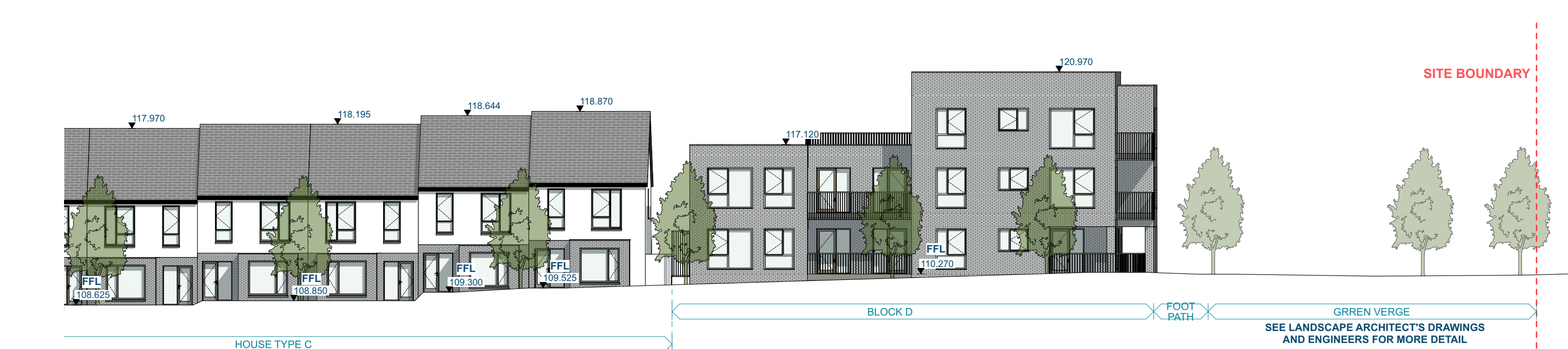
1:200 Contiguous Elevation C - Part C