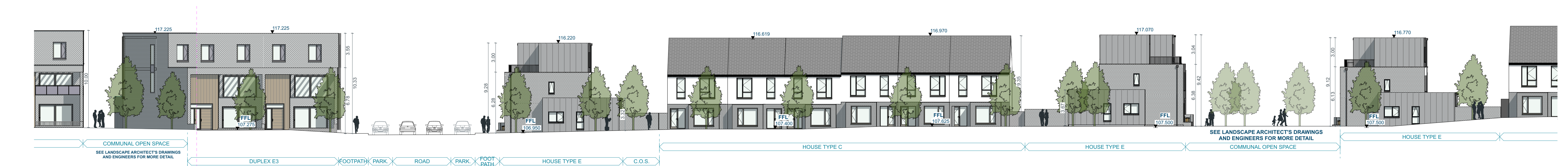
1:200 Contiguous Elevation C - Part B