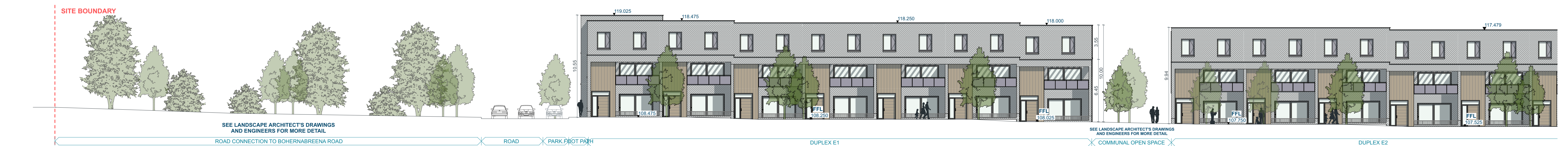
1:200 Contiguous Elevation C - Part A