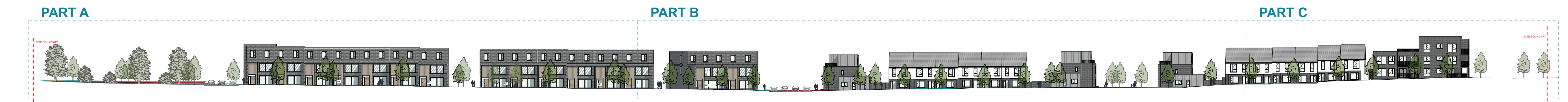
1:500 Contiguous Elevation C